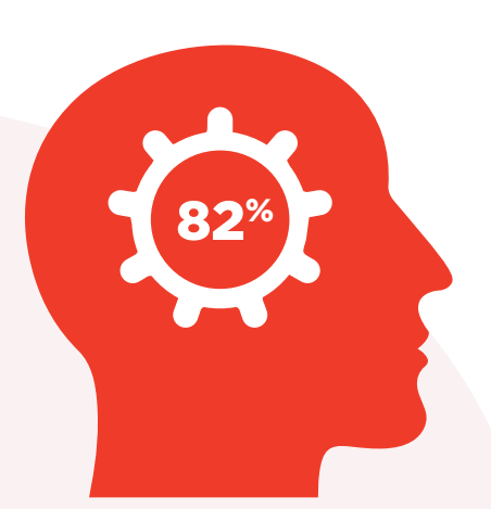
OF STUDENTS surveyed believe that intercultural skills are valuable .